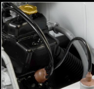
Highly detailed engine